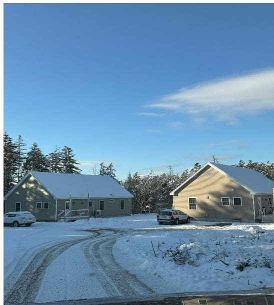
Two New GCI houses

The Homes and Families Committee also did a review of CIRT's rent structure and made recommendations regarding nominal increases beginning in January 2026.