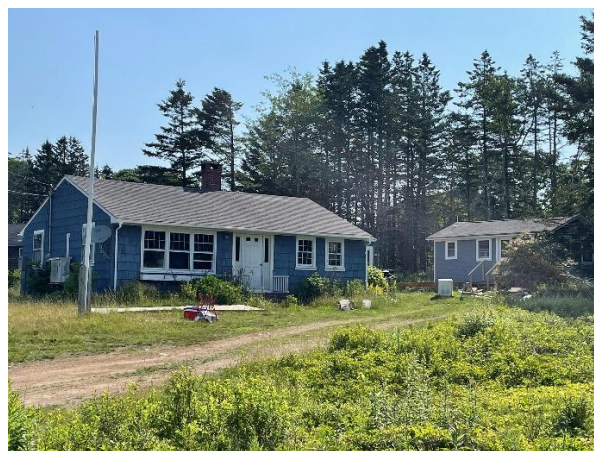
Maple Ave houses July