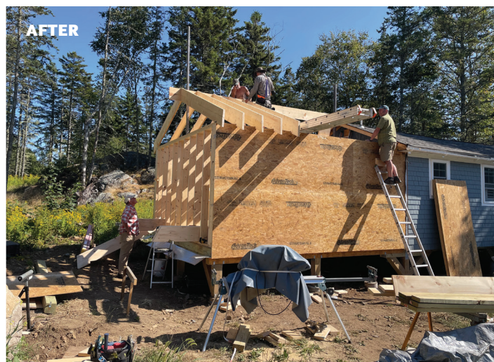
CIRT is renovating a tiny studio on Maple Ave., long used for summer visitors, and is turning it into a one-bedroom home for year-round use.