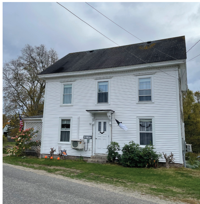
The 3-bedroom house on Cross Road, originally built around 1870, has been updated and renovated for year round occupancy.

CIRT is very grateful that the Egglestons kept their resolve to see the Maple Avenue and the Cross Road properties sold for year-round use. By developing four homes on these two tracts, CIRT has advanced its core mission: Nurturing the island community by expanding the availability of affordable year-round housing.